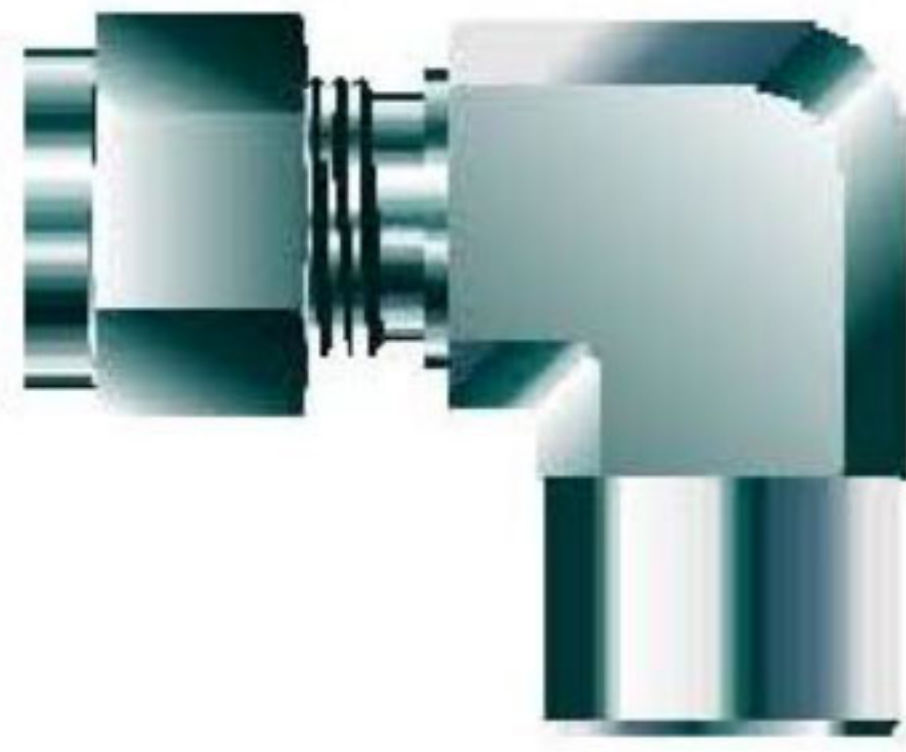
Female Elbow SM-FE