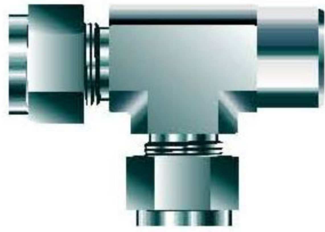
Female Run Tee SM-FRT