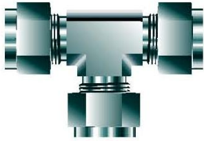
Union Tee SM-UT